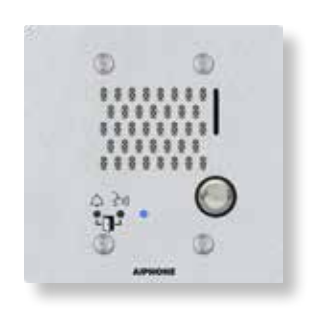
IX-SS-2G Audio Door Station