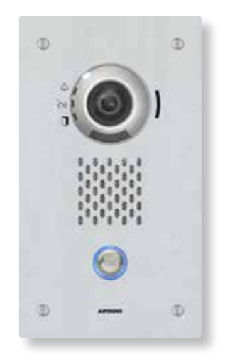
IX-DVF IP Video Door Station